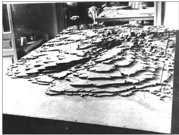
Figure 1. Hardboard contours nailed together and mounted in position at MEIU, Cairo.

Photographs of a method of production similar to that described above survive from the model-making units based at Medmenham and at Heliopolis, near Cairo. The latter unit operated as part of the Middle East Intelligence Unit and provided a portfolio of photographs and captions to assist in training model makers. Figure 1 shows the hardboard contours nailed together and mounted in position. Clearly, model-making materials varied according to the specific location. The model makers in Cairo used “mangarieh,” a mixture of minced newspaper, local plaster, and glue (Figure 2). A photo-skin was created by mosaicing re-scaled photographs of the area and pasting the photo-skin to the model, using road intersections or other common reference points for registration. The availability and close scrutiny of aerial photography using stereoscopes was an essential