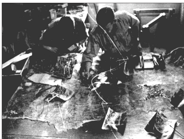
Figure 3. The availability and close scrutiny of aerial photography was an essential part of the more detailed stages in the modeling process. MEIU, Cairo.