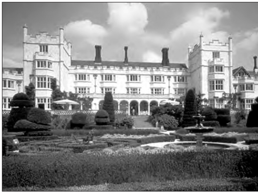
Figure 14. Danesfield House, Medmenham, Buckinghamshire.

During the formative stages of the model-making section, model makers needed sculptor's spatulas, artist's brushes, and texturing materials. Because none of these items were listed in the RAF Supply Catalogue, personnel had to scrounge materials and equipment from their own studios or buy them out of their meager wages of one shilling per day. (Wages could be more, depending on rank and gender; women could expect two-thirds of a man's pay.) The entire workforce was male to begin with, but as demand for models increased, recruiters began searching with some success for women volunteers.