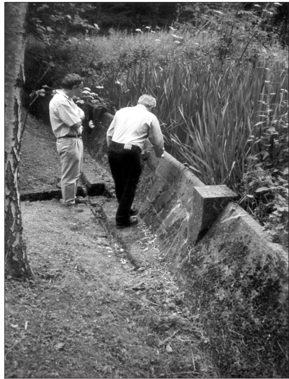
Figure 8. Explosive tests were carried out by the Road Research Laboratory on large-scale models built by the Building Research Station between November 1940 and January 1941.

Paul Brickhill recalls the use of the models during the Dambuster Raid in his book The Dam Busters (1954). Wing Commander Guy Gibson used