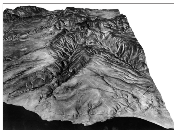
Figure 5. The finished model.

illuminated and then photographed to replicate as closely as possible the light that would exist at the time of the planned operation. Aircrews could thus be briefed with photographs taken from above the model, whereas Commandos would be shown photographs of the model as if viewed from the sea.