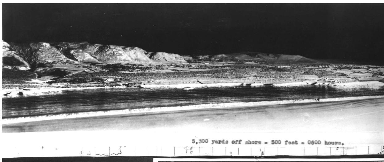
Figure 12. Low oblique of landscape under artificial light conditions that imitated the likely appearance of the shore as the operation progressed and at different times. Coast near Avola, Sicily, at 06.00, 5,300 yards offshore and at an altitude of 500 feet.

installations and launch sites for Hitler's secret weapons program. Constance Babington-Smith, in her book Evidence in Camera (1961) recounts in detail the extraordinary events that led to the discovery of a key research establishment for the V-weapon program. An RAF Mosquito, failing in its mission to take photographs of Berlin because of cloud cover, exposed its remaining film over the Baltic coast at Peenemünde, north Germany. On one photograph, interpreters detected the small cruciform shape of a hitherto unfamiliar type of aircraft. Unaware of the site's significance, the model-making section used this one photo to construct a detailed model of the site by measuring shadows to estimate heights and adding details based on photo interpretation (Abrams 1991). The detailed model of Peenemünde, Model M400 (Figure 13), became the focus of attention for a team of experts in industrial interpretation, ballistics, ordnance, and aircraft analysis. New reconnaissance photographs clarified any remaining doubts that Peenemünde was the research center for the development, testing, and launch-crew training for German V-weapons. Subsequent raids on the site delayed German V-weapon attacks on Britain by an estimated four to six months. Models were also constructed of sites in northern France to brief bomber crews prior to raids on these launch sites. The Allied Central Interpretation Unit, including V-Section, thus contributed significantly to the silent war of military intelligence.