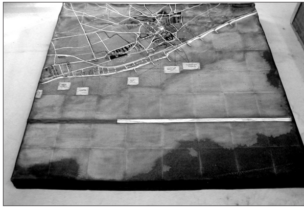
Figure 6. A typical egg-crate model of Sword Beach used for planning the assault landing on D-Day, June 6, 1944.

Canadian Army made a number of models during the operations to liberate The Netherlands. Officers in the Royal Navy were also trained in their construction.