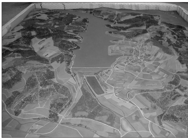
Figure 9. Model of the Sorpe Dam, Germany.