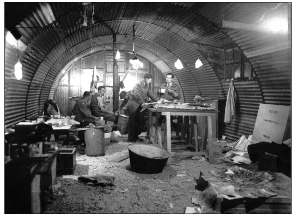
Figure 15. Working conditions at La Marsa, Tunisia, were very different to those experienced at Danesfield House.

There was friction between the American and British forces throughout the war, and the model section was no exception. The Americans were continually annoyed that all the models were dispatched with only British markings, in no way recognizing the American share of the effort in their construction. Out of frustration, an American cleverly introduced surreptitiously the letters 'U' and 'S' into woodland on one of the models. The differential in pay scales was an additional source of friction. The Americans began to get stripes as corporals and sergeants in recognition of their role as specialists, much to the chagrin of their British colleagues. On the other hand, American commanders, who clearly resented the fact that the model-making detachment was not under their direct control, ignored complaints by American servicemen concerning the quality of food supplied by the RAF.