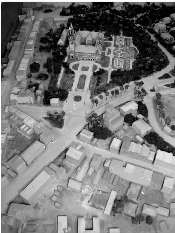
Figure 10. The larger-scale model for identifying the target. Close observation of the model reveals a caricature of the building facade. Aircrews were unlikely to require more accuracy, given the high speed and low altitude of their flight.

As World War II progressed, improvements in aircraft, munitions, and intelligence increased the capability of Allied air power to carry out precision bombing of small targets in towns and cities. However, precision bombing would have been impossible if aircrews could not recognize