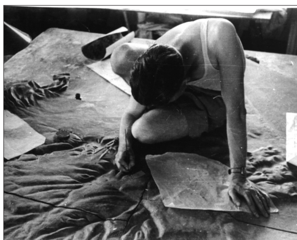
Figure 4. Maps were used for reference to locate airfields, railways, and roads.