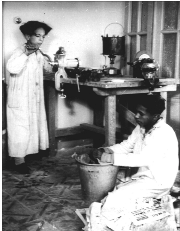
Figure 2. The model makers in Cairo used ‘mangarieh’, a mixture of minced newspaper, local plaster and glue. [Reproduced with kind permission of the Public Record Office.]

part of the more detailed stages in the modeling process (Figure 3). Maps were used for reference to locate airfields, railways, and roads (Figure 4) before the model was finished (Figure 5).