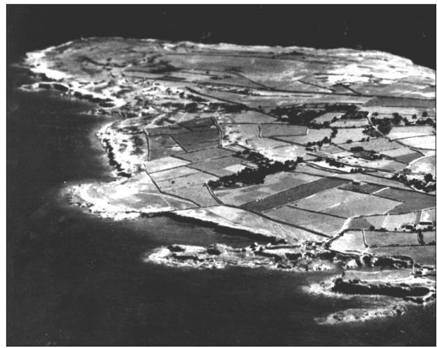
Figure 11. Stretch of coastline south of Syracuse, Sicily.

The compact form of this information facilitated the inclusion of annotations and cross-references, and because those who were to use the photographs chose the viewpoints, each force received the pictures and type of information it required. Those who worked on the models identified several advantages of vertical photographs of the models over photographic mosaics. The photo-