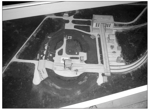
Figure 13. The detailed model of Peenemünde, Model M400.

Working conditions for the Americans were made worse because many of their superiors